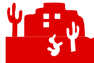
My home is my castle